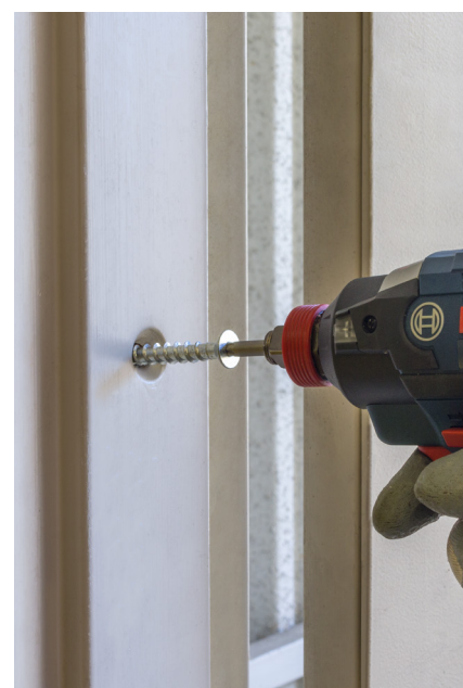
Application in hollow metal door frame.

Suggested fixture hole sizes are for structural steel thicker than 12 gauge only. Larger holes are not required for wood or cold-formed steel members.