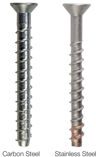
Carbon Steel Stainless Steel