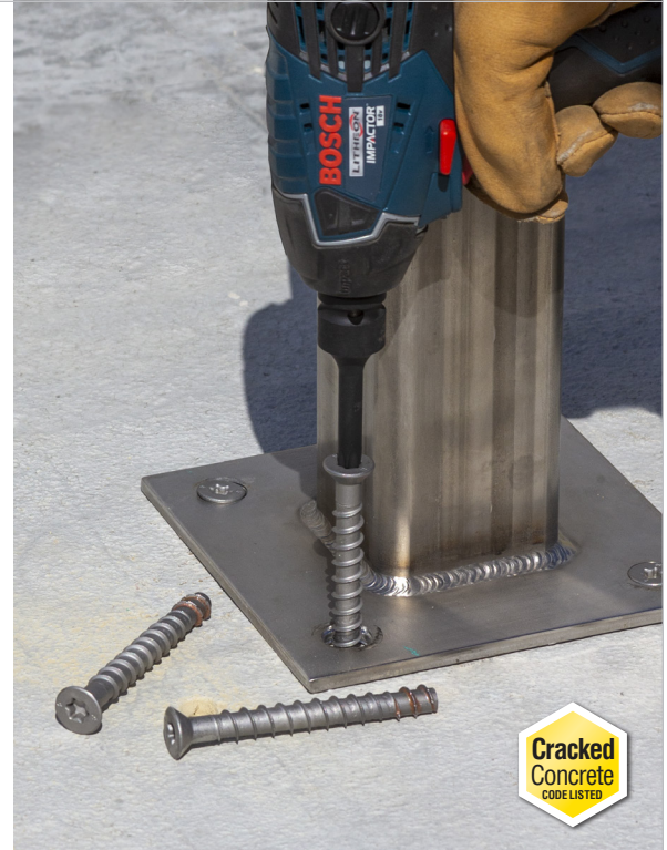
Titen HD countersunk installation.

Material: Available in carbon steel (zinc plated) and Type 316 stainless steel